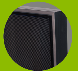
SOLARIA POWERXT optimized for maximum power

With more energy per square meter than traditional panels, Solaria PowerXT packs maximum power into minimum space for industry-leading efficiency you can see.